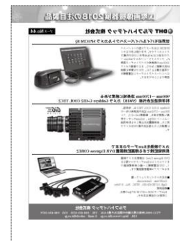
( Tie-up advertisement )