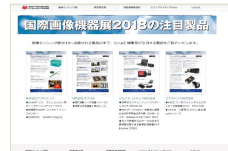
( Special page at web site )