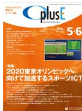
( OplusE )