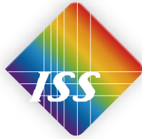
IMAGE SENSING SHOW 2017